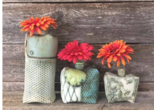
Slumping Vases by Stephanie Burton

Georgies Interactive Pigments are blends of natural mineral oxides that work in ALL firing ranges: